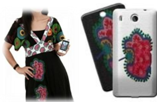
Figure 1 Kashanipour's Matching application

There is a wide range of software and services targeted at fashion conscious users. These are