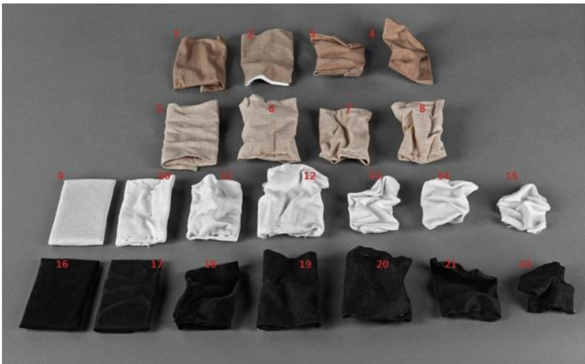
Figure 2 samples, from geometric to organic

The industrial designer had the sole responsibility for the ‘aesthetic laboration’ (Atkinson 2006), to generate a concrete instantiation in the space described. Her work included participation in workshops on the topic ‘design naturally’ led Professor Cheryl Akner Koler and the industrial