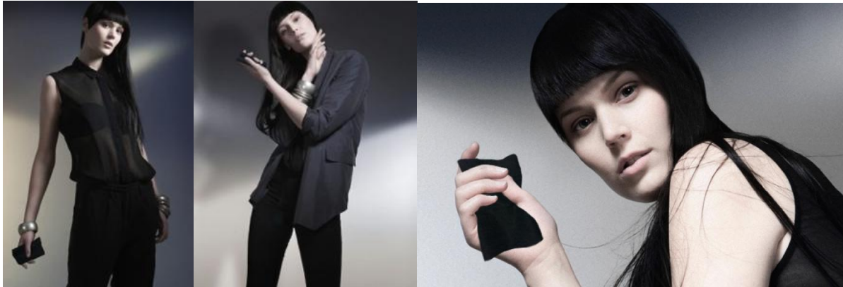
Figure 3 Shape Switching phone presented in Swedish style (no.18)

Swedish style. If the photos appear in fashion magazines or public advertisement, they would disseminate the ideal 'shape switching phone is fashionable'.