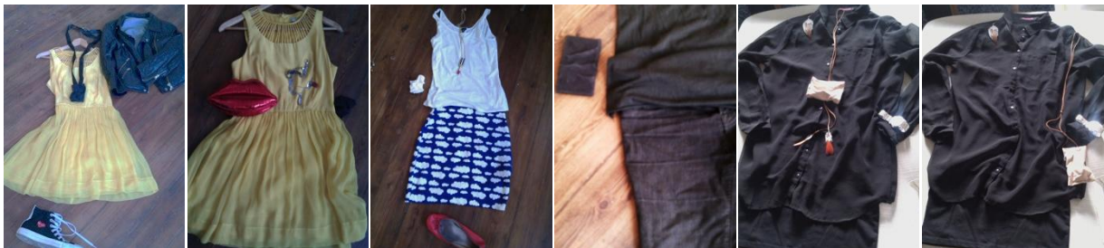
Table 1 Variations of outfits