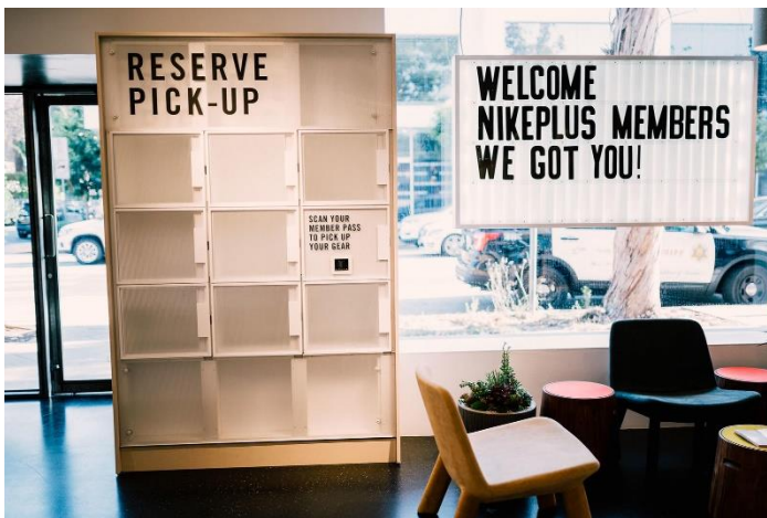
Figure 9 - Nike omnichannel