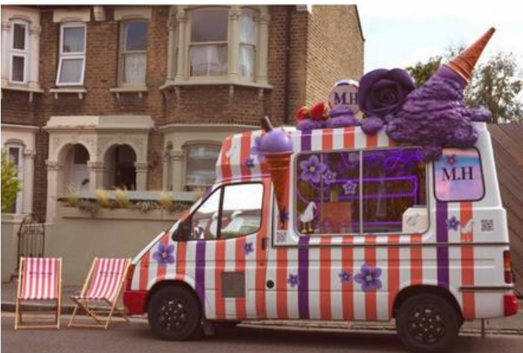
Figure 2 - Ice Cream Van