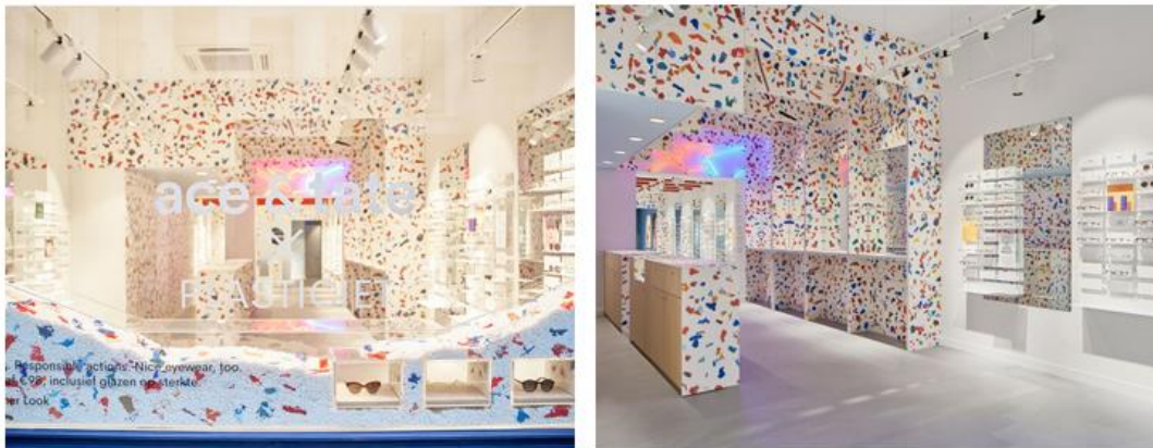
Figure 7 - Ace & Tate