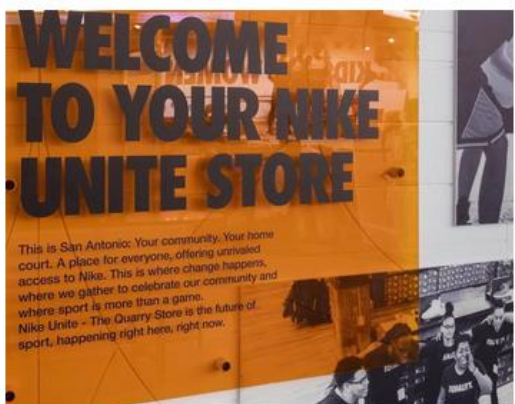
Figure 4 Nike Unite

It is necessary to keep the essence of the brand inside the store, but their stores can be adapted according to the place where they are. Thus, they must be aware of the local causes and also shape their stores according to customers' specific needs in each region. Nike Unite tries to create new experiences through the community where they are. The design elements in the store establish connections with the neighborhood (Figure 4). When Australian beauty products brand Aesop decided to open a store in São Paulo, it had its design done by the Campana brothers and cobogó (a tile with typically Brazilian design) as an inspiration (Figure 5).