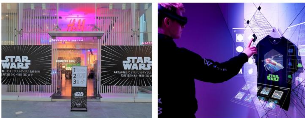
Figure 8 - H&M Tokyo

Going hand in hand with the physical space, technology is being used with the purpose of facilitating the shopping process and also help brands offer their products in a more innovative way. Due to the Covid-19 pandemic, these technologies can also make consumers more at ease when visiting a fashion store. Tokyo H&M offered their clients the experience of customizing products using augmented reality technology in the launch of their Star Wars collection (Figure 8).